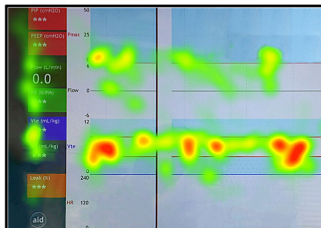
Figure 2 Example heat map. Heat maps are a graphical representation of the mapped gaze data, where colours indicate the density of gaze fixations (density increases from green-yellow-orange-red). Here the heat map demonstrates the summary of all gaze points on the respiratory function monitor (RFM) recorded during the simulation. These are mapped onto an exported image of the RFM screen. The highest density of gaze fixations, indicated by the red colour of the gaze point clusters, are seen overlying the exhaled tidal volume waveform region.

Even following successful calibration of the eye-tracking glasses, it is possible to have a small but systematic offset between the actual and measured gaze location. 19 To account for